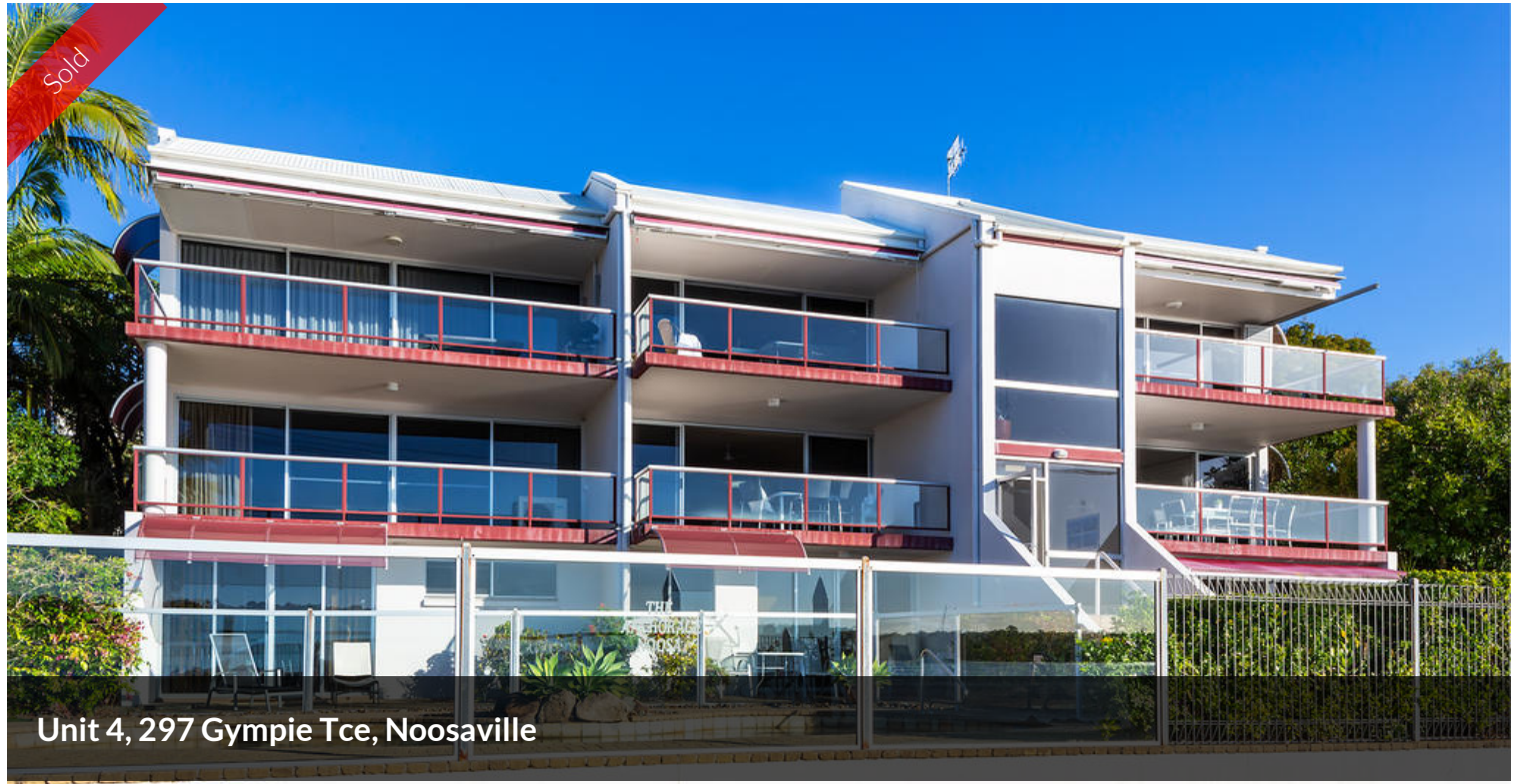
Unit 4, 297 Gympie Tce, Noosaville